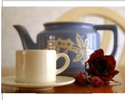
The actual Ole Blue Teapot Without a Lid

I felt faint - but mom just graciously knelt down to pick up the pieces around my bare feet and softly said, "Don't move now, honey, I must get all these tiny pieces of glass